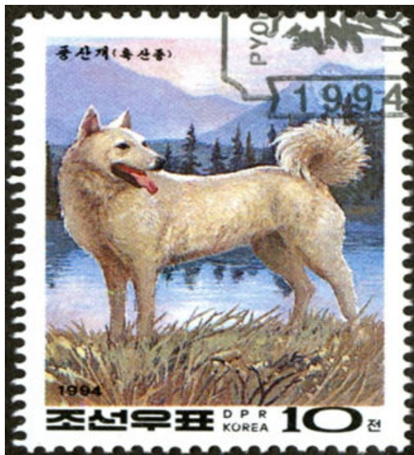
Pungsan dog, North Korea Stamp Collection