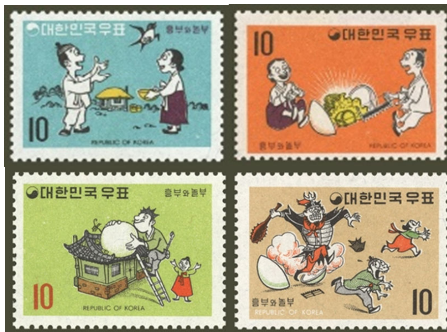
“Heungbu and Nolbu” stamp series, printed on Children’s Day, May 5, 1970

The folktale of brothers Hungbu (pronounced: HUUNG-boo) and Nolbu (pronounced: DOHL-boo) is known throughout the Korean peninsula. It was even retold in a 1970s South Korean stamp series (see images below). As the story goes, Hungbu and his wife are kind and generous people. Though they are poor, they maintain their good natures. One day they find a sparrow with an injured leg, and they nurse the injured sparrow back to health. The sparrow then returns the next spring with a gourd seed, which the couple plants. They harvest the ripened gourds to find wealth beyond their dreams. It is a reward from the Sparrow King for their good deed.