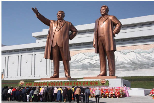
The statues of Kim Il Sung and Kim Jong Il on Mansu Hill in Pyongyang